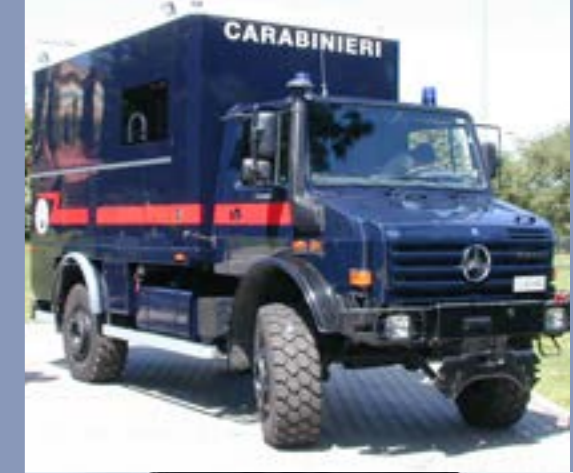
ENVIRONMENTAL PROTECTION AND SURVEILLANCE