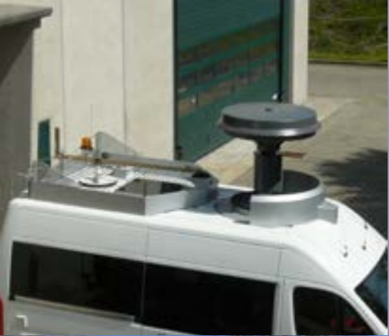
TELECOMS MONITORING & TELESCOPIC MASTS