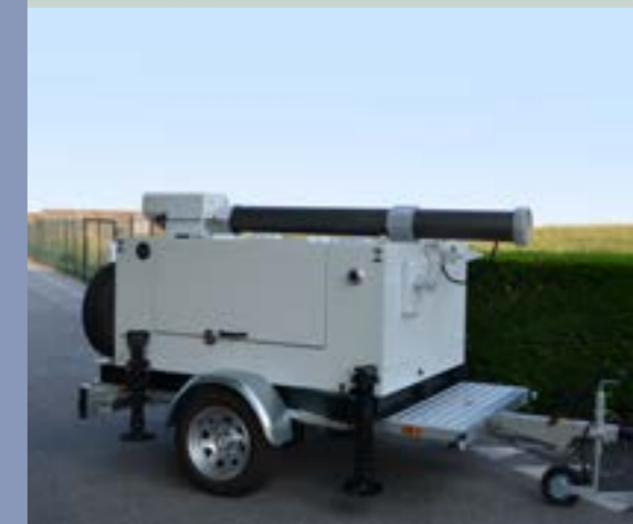
SEMI - PERMANENT STATIONS ON TRAILERS