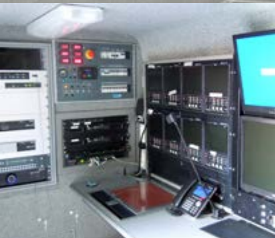
MOBILE OPERATIONS CENTERS