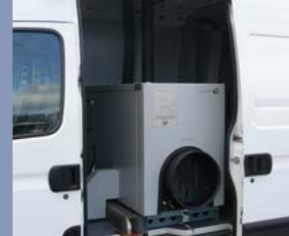
MOBILE POWER SUPPLY