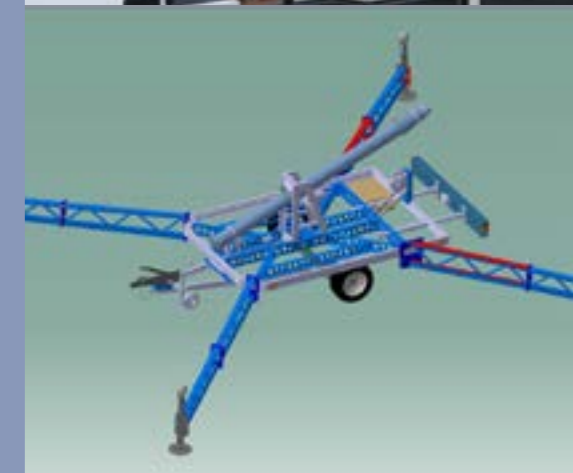
SPECIAL CUSTOMIZED PROJECTS. ENGINEERING AND DEVELOPMENT