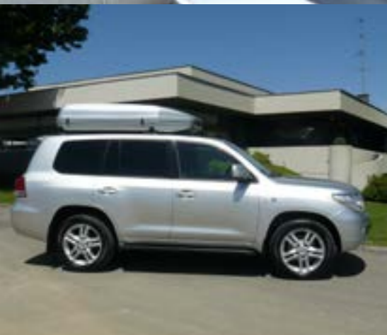
MOBILE SOLUTIONS FOR POLICE INVESTIGATION AND SECURITY MANAGEMENT