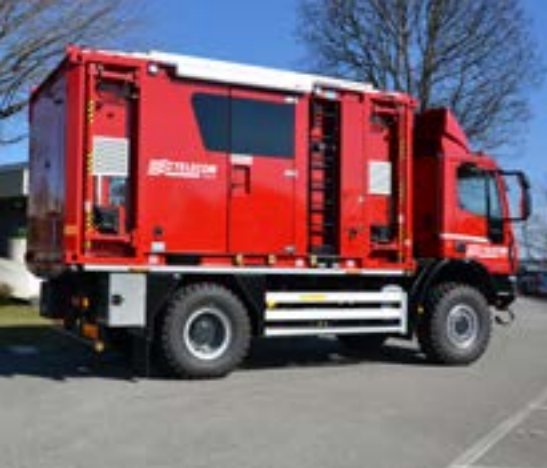
TELECOMS DISASTER RECOVERY